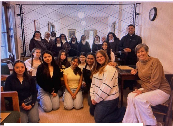
Photo from a past retreat

Together, these experiences form a rich and lasting foundation for a life of faith and service.